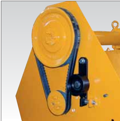
Adjustable belt tension.