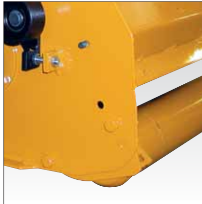
Rear adjustable roller