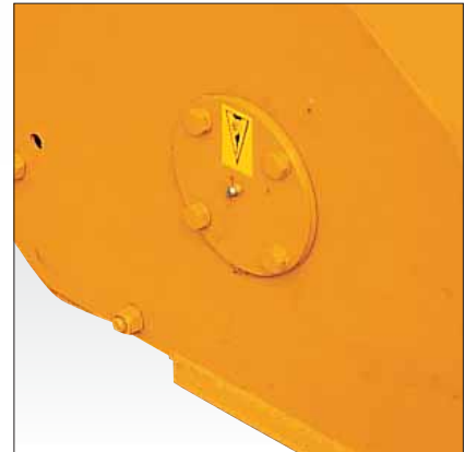
Rotor internal sealed bearings